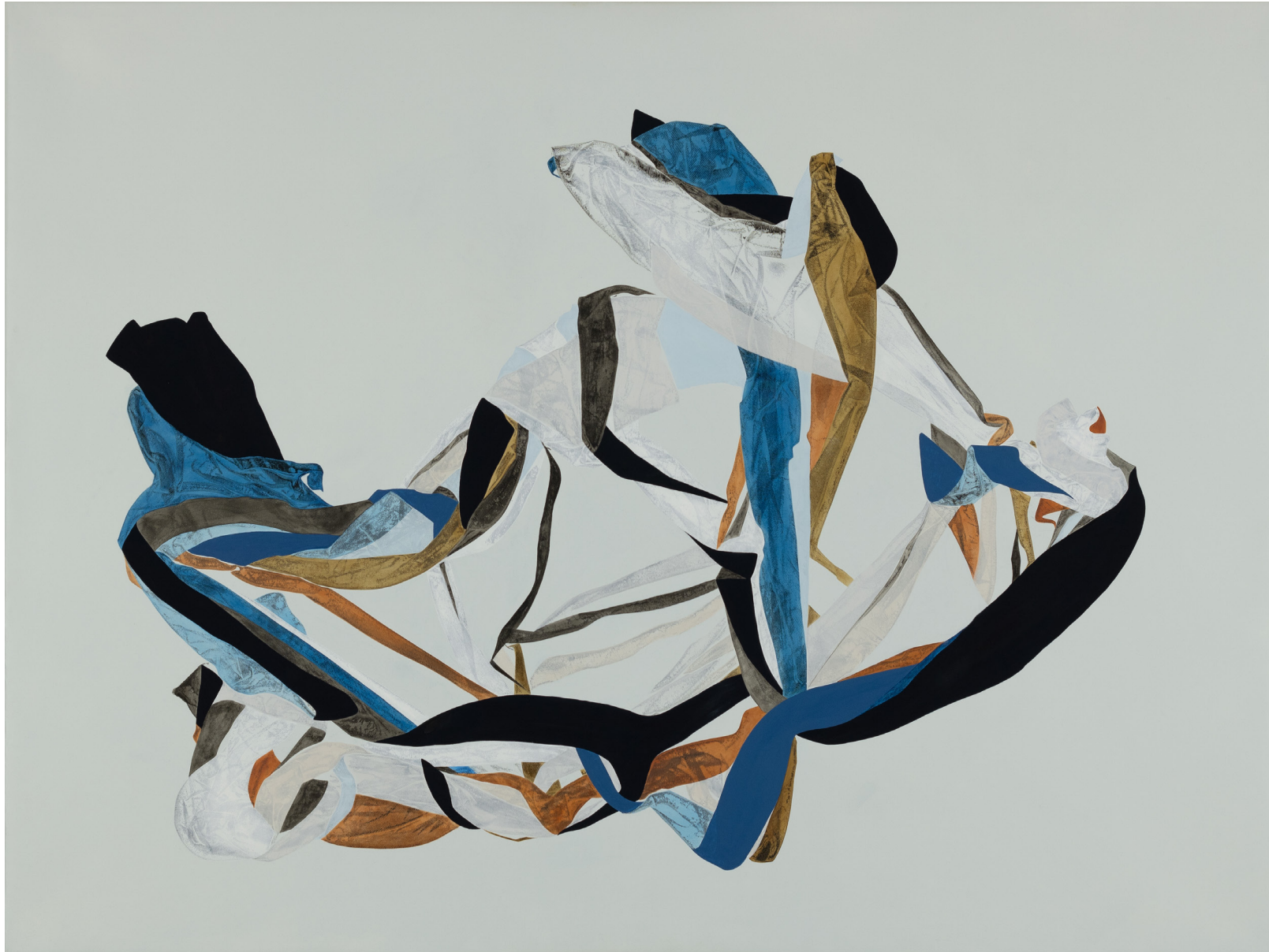
Ohne Titel | 2022 Mixed media on stretched paper | 120 x 90 cm