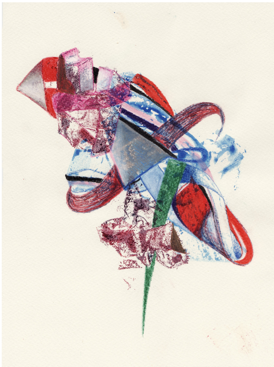
Moto | 2013 Mixed media on paper 15 x 20 cm

Painting is a door that observes us silently from afar. To choose to cross its threshold means, for a moment, to leave reality behind: for many, a cold diamond implanted in our mind, disciplining it according to its hard, crystalline, and orderly nature, where everything appears to us as already predetermined, sometimes even finished.