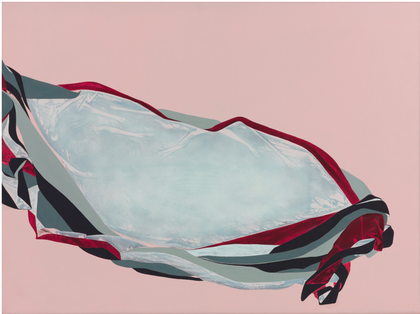
Ohne Titel | 2020 | Mixed media on stretched paper | 80 x 60 cm