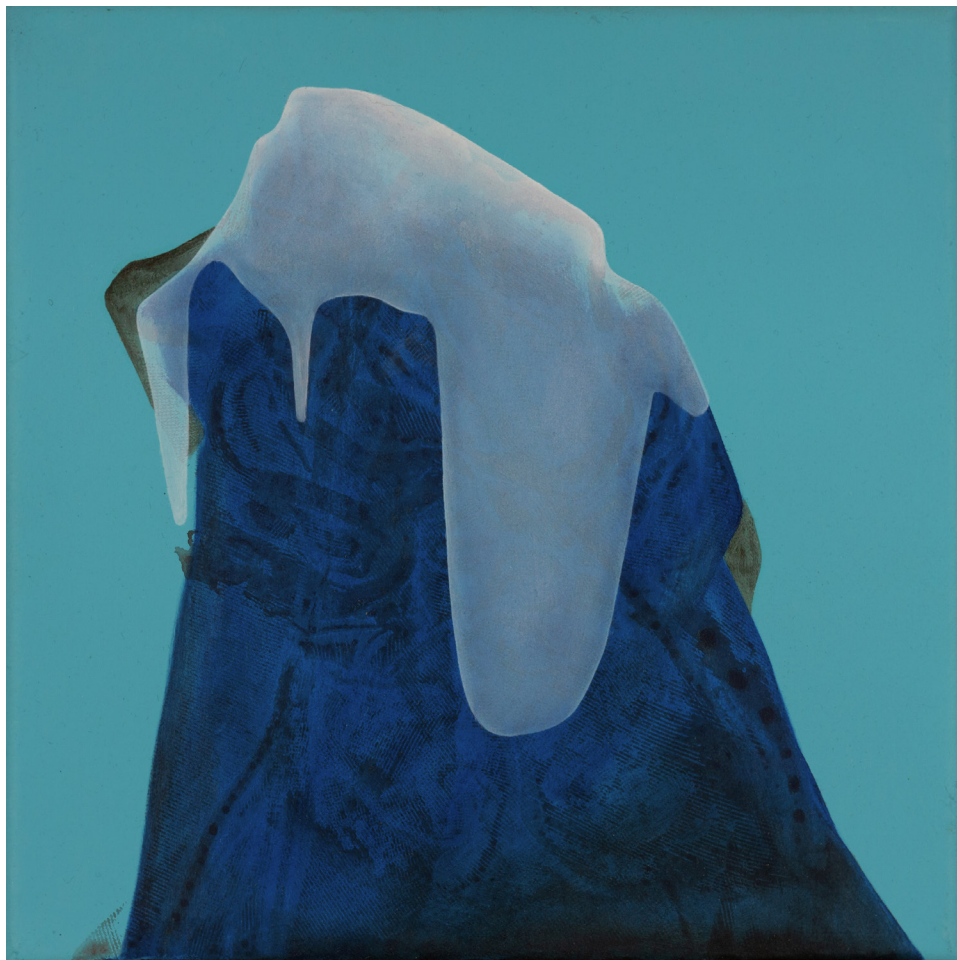
Ohne Titel | 2020 | Mixed media on stretched paper | 20 x 20 cm