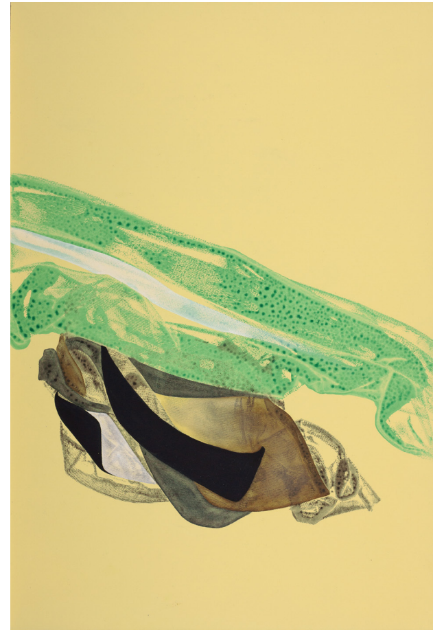
Ohne Titel | 2020 Mixed media on paper 30 x 42 cm