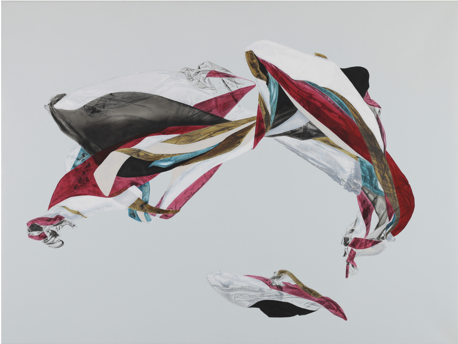
Ohne Titel | 2023 Mixed media on stretched paper | 120 x 90 cm