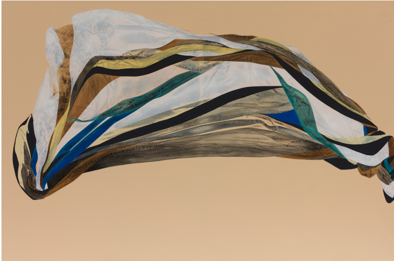
Ohne Titel | 2021 Mixed media on stretched paper | 120 x 80 cm