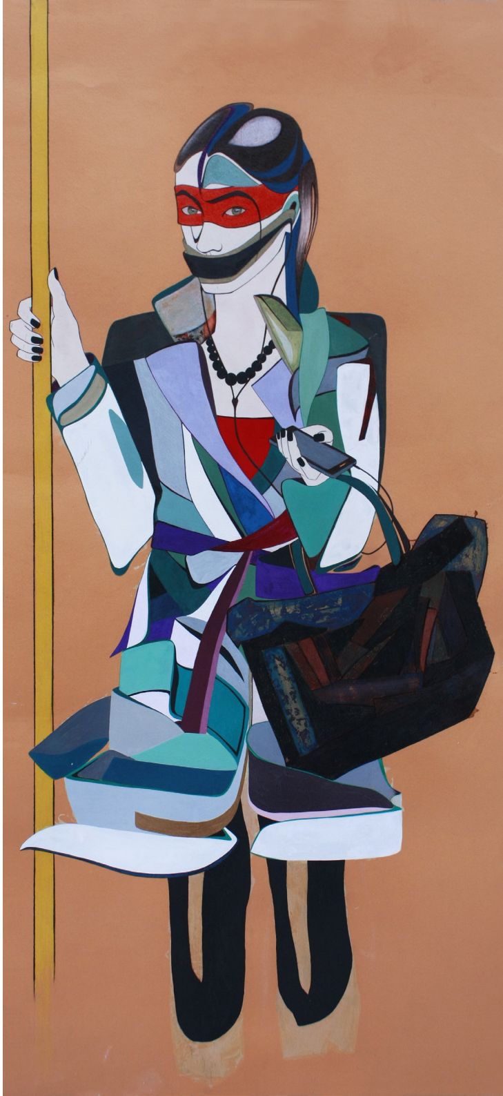
Frau in der U3 | 2014 Mixed media on paper 40 x100 cm