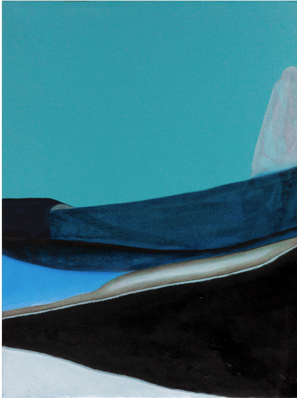
Ohne Titel | 2020 | Mischtechnik auf gespanntem Papier | 18 x 34 cm