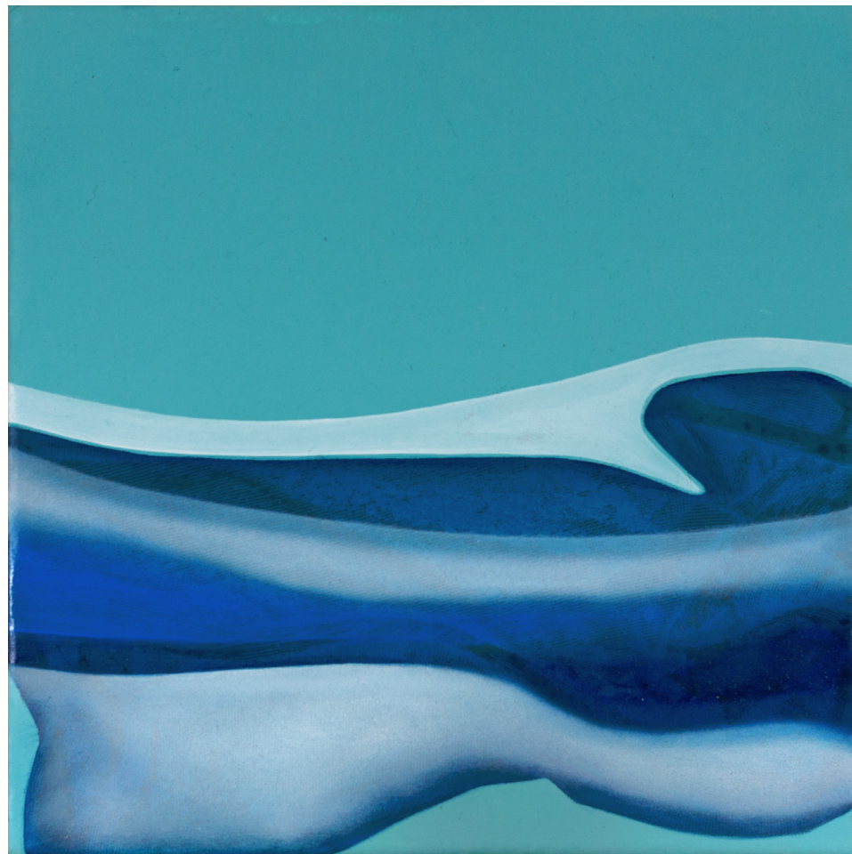
Ohne Titel | 2020 | Mixed media on stretched paper | 20 x 20 cm