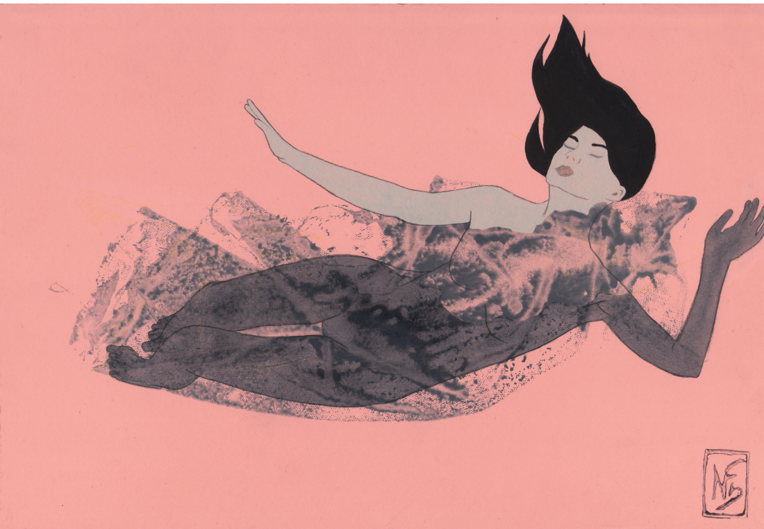
Ohne Titel | 2017 | Mixed media on paper | 21 x 29 cm

It is from the search for certainty and stability that I die every day.