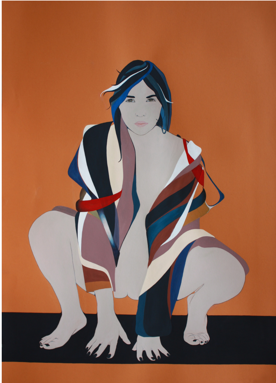
Non sai essere alla mia altezza 2015 | Mixed media on paper 70 x 100 cm