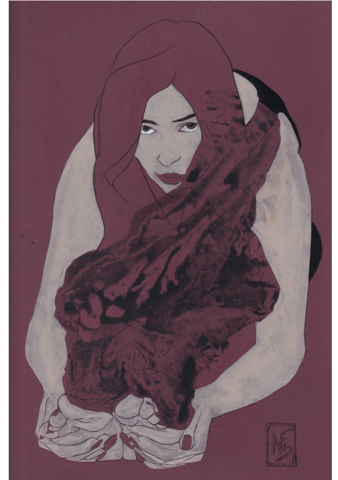
Miesmuschel | 2016 | Mixed media on paper | 21 x 29 cm