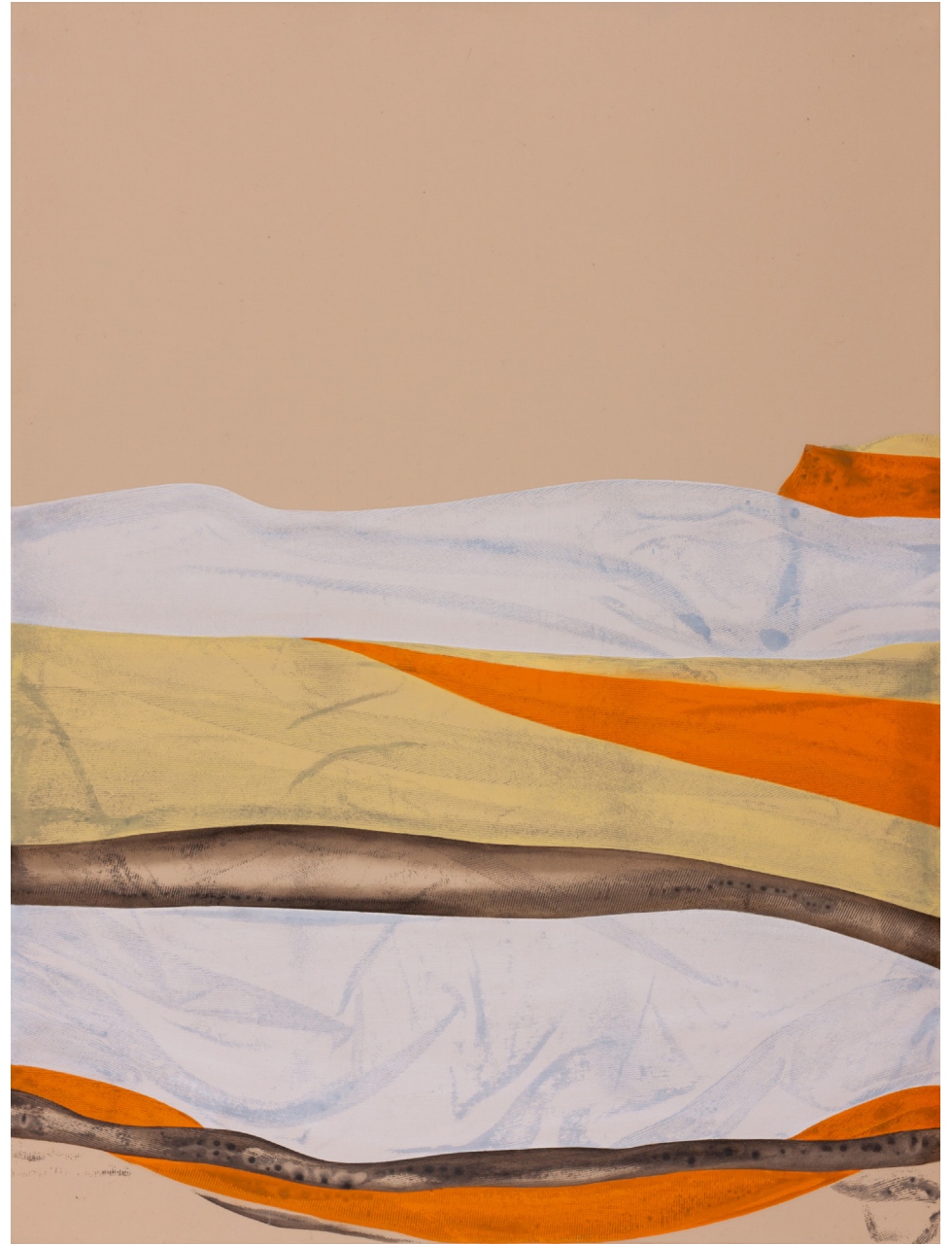
Ohne Titel | 2020 | Mischtechnik auf gespanntem Papier | 30 x 40 cm