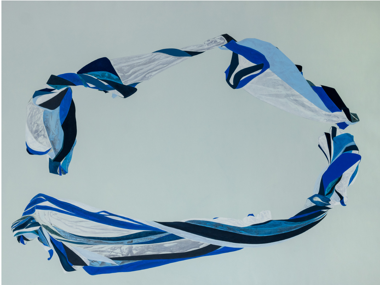
Ohne Titel | 2022 Mixed media on stretched paper | 140 x 100 cm