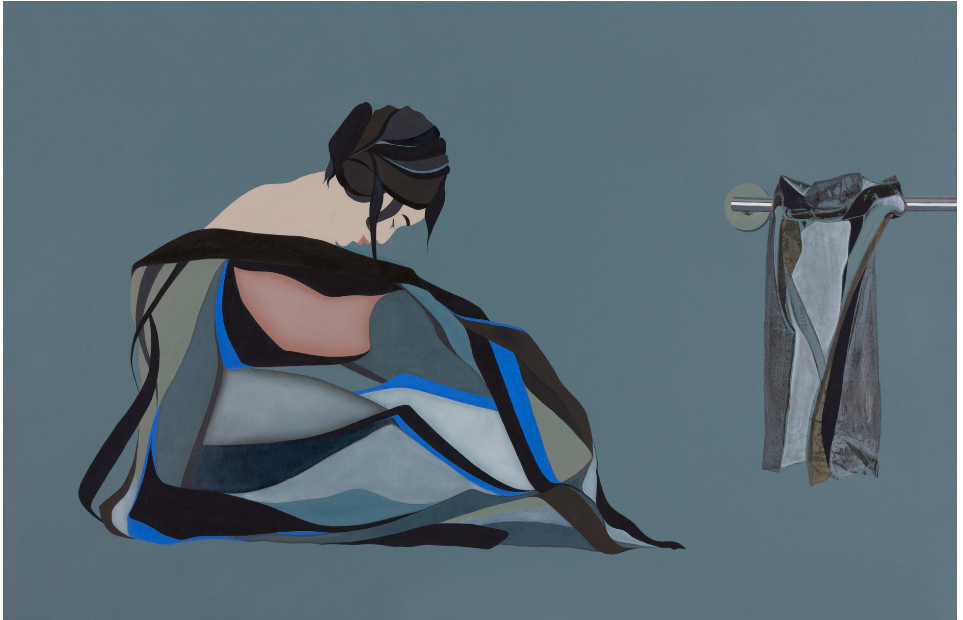
Die Badende | 2020 | Mixed media on stretched paper | 110 x 70 cm