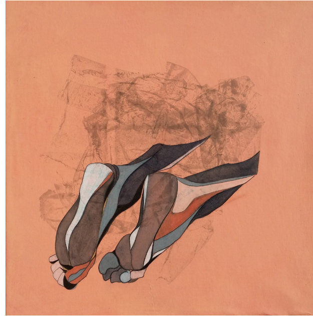
Piedi | 2016 | Mixed media on stretched paper | 40 x 40 cm